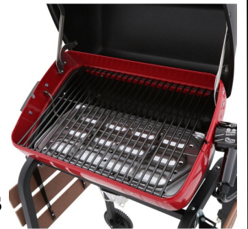
Easy Street Grills