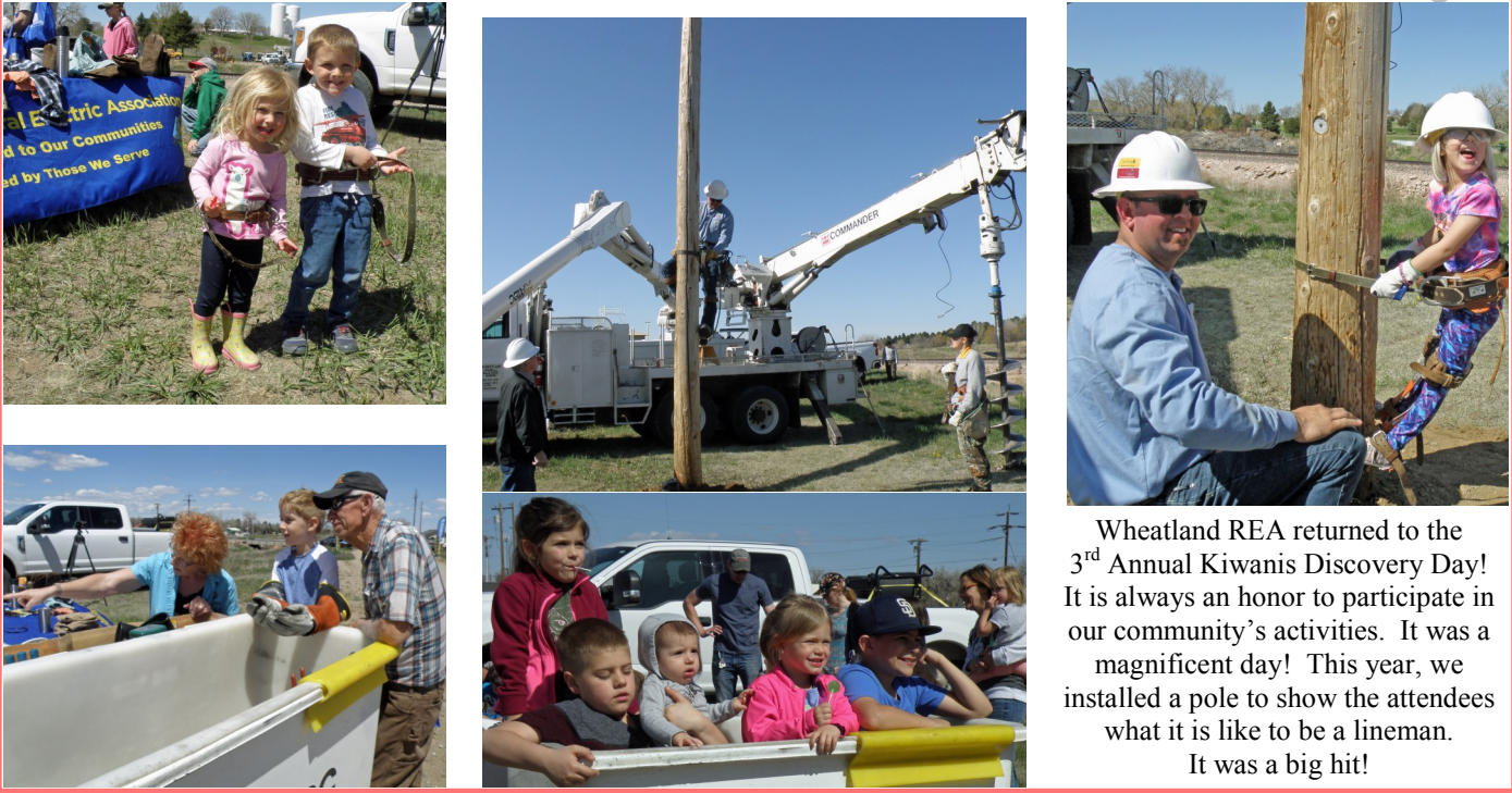
Wheatland REA returned to the 3 rd Annual Kiwanis Discovery Day! It is always an honor to participate in our community's activities. It was a magnificent day! This year, we installed a pole to show the attendees what it is like to be a lineman. It was a big hit!