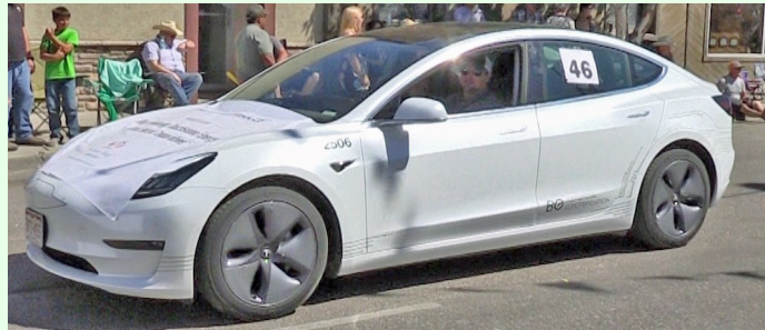
2020 Tesla, Electric Vehicle Powered by Wyoming Coal, Natural Gas and Wind “Constructing the Future”