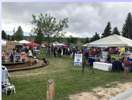
2000+ attended the Cookoff to enjoy lots of chili and other events throughout the day.